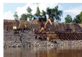
Measures against erosion on the Mekong River, Laos