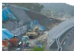
Restoration of damaged slopes, Tokyo