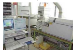
ICP-MS for analysis of trace contaminants