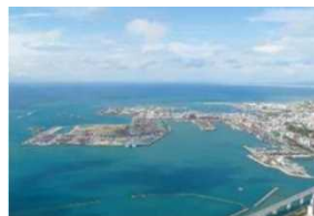
EIA for large-scale infrastructure projects