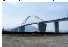
Shunan Bridge, Yamaguchi Pref.

IDEA Consultants, Inc. is a new type of integrated consultancy firm, providing services in every phase of infrastructure development and environmental conservation projects, from the project planning, survey, analyses, and assessment phases, to the design, maintenance, and management phases. These expert services are provided to meet client's requirements.