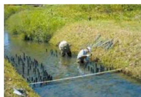
Survey on aquatic biodiversity