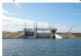
Ryousou Watergate, Chiba Pref.