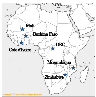
Recent projects in African countries (2013~2020)

Furthermore, AAS has provided consulting services, particularly for designing and implementing robust geographic database management systems in developing countries. This has enabled government organizations to manage, use as well as share digital topographic maps. In recent years, AAS has participated in forest preservation projects in Africa and the Asia-Pacific region as part of REDD+.