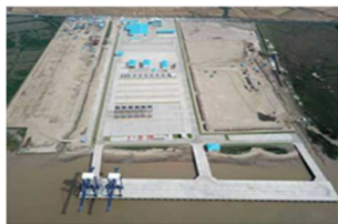
Container Port (Myanmar)