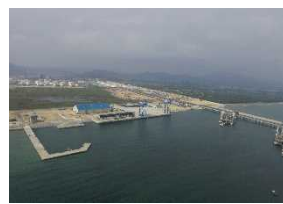
Refinery Plant (Vietnam)