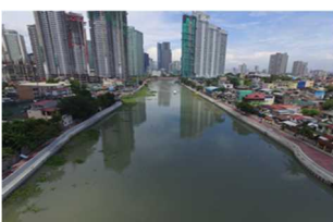
River Improvement (Philippines)