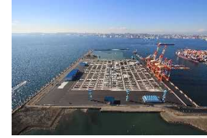
Container Port (Japan)