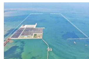
Container Port (Indonesia)