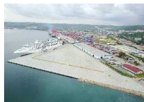
Multi-purposed Port (Cambodia)