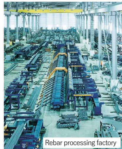
Rebar processing factory