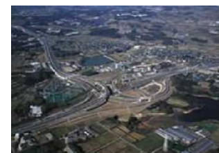
Chitahanto Road Handa-Chuo Junction