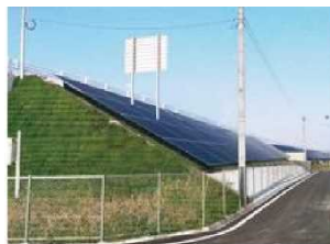
Ariake Engan Road, Saga Prefecture: The First Road to Generate Solar Power