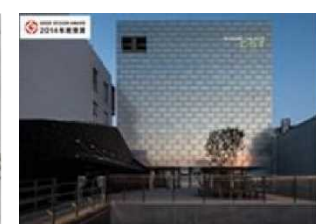
Toride Cycle Station, Ibaraki