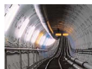
Nakagawa Public Utility Conduit