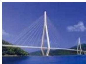
Korea: Yeosu-Goheung Bridge Link Competition