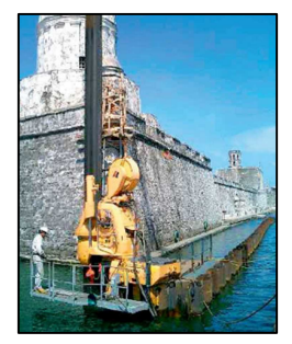
Above water (Mexico)

GIKEN's construction solutions apply to various difficult projects for urban development under restricted site conditions and hard ground conditions as well as disaster prevention projects.