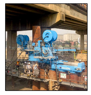
Under the bridge (Bangladesh)