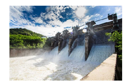
For Dam and Weir Shaft-rotation type Wire-spring type