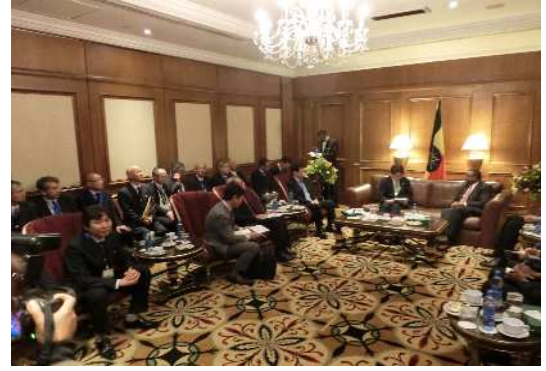
<State Minister for Foreign Affairs Kiuchi's Courtesy Call on Prime Minister Hailemariam with Vice-Minister for Infrastructure of Ministry of Land, Infrastructure, Transport and Tourism Sasaki and 16 companies on the 14<sup>th</sup>>