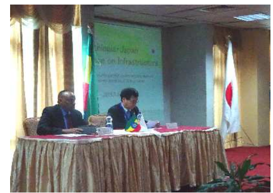
<Vice-Minister for Infrastructure of Ministry of Land, Infrastructure, Transport and Tourism Sasaki and State Minister of Transport Tekle-Tsadik>

Transport and Tourism Sasaki paid a courtesy call on State Minister of Transport Tekle-Tsadik and Minister of Urban Development and Construction Mekuria.