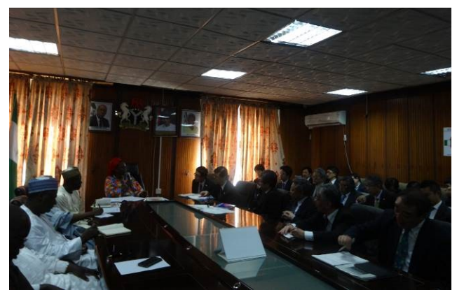
<Courtesy Call on Minister of State for Industry, Trade & Investment Abubakar>