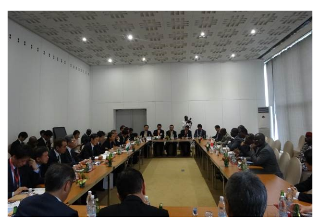
< Meeting with Minister Achi, Minister Toure and Japanese Companies >