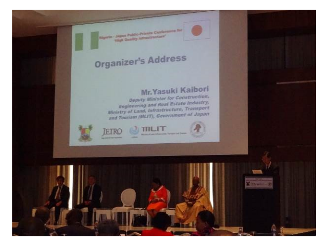
< Opening Remarks by Deputy Vice-Minister Kaibori >