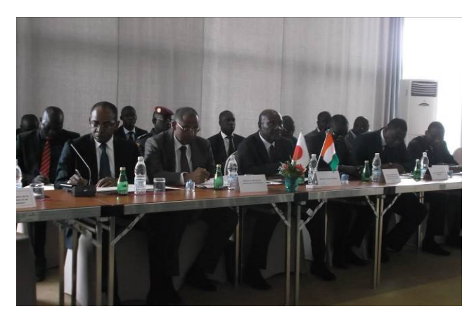
< Meeting with Prime Minister Duncan >