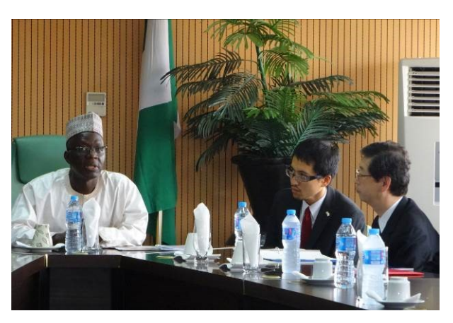
<Courtesy Call on Permanent Secretary of Ministry of Foreign Affairs Lolo>