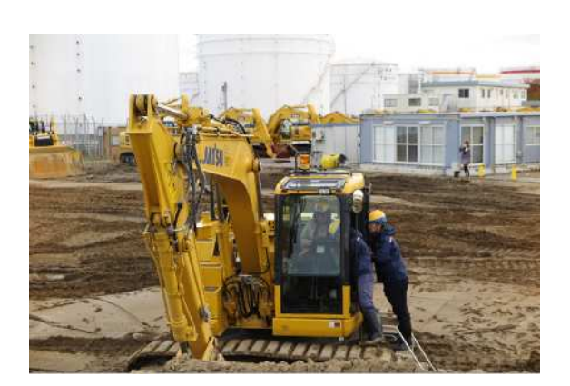
3 < Test Ride of ICT Construction Machine> * Test ride was done in private property considering safety.