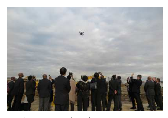
2 < Demonstration of Drone Survey>