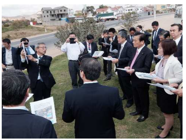
<Visit to National Route 7 Bypass>