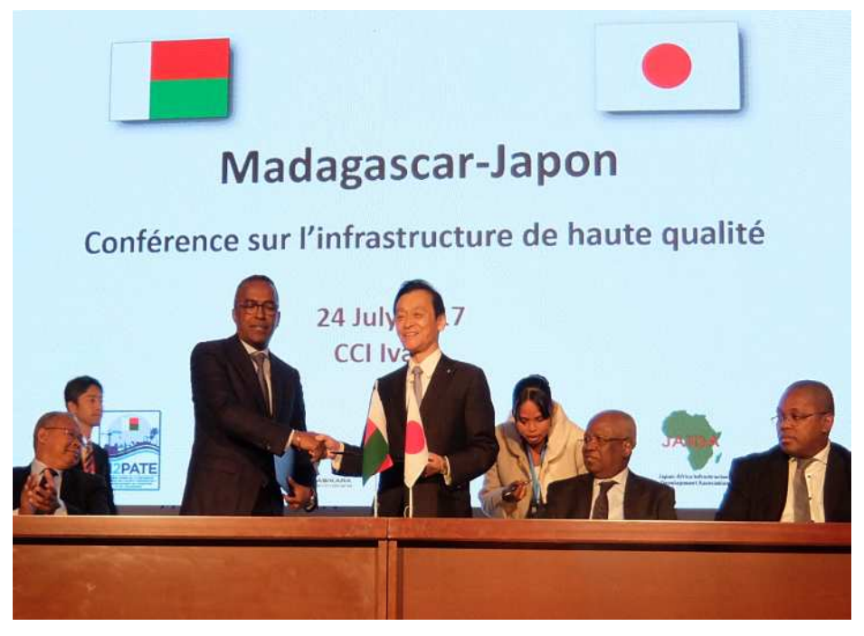
<Signing Ceremony> (State Minister of Land, Infrastructure, Transport and Tourism Suematsu and Four Ministers of Malagasy Government)