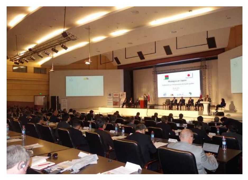
<Opening Speech (Opening Remarks) by State Minister of Land, Infrastructure, Transport and Tourism Suematsu>

After the opening speech (opening remarks), a keynote speech, signing ceremony, workshop and business matching were held.