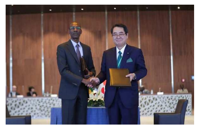
<Signing Ceremony (State Minister of Land, Infrastructure, Transport and Tourism Makino and Minister of Infrastructures, Land Transport and Opening-Up Diallo)>