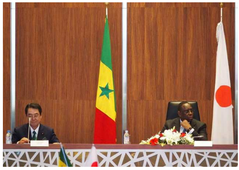
<High Quality Infrastructure Conference (State Minister of Land, Infrastructure, Transport and Tourism Makino and President Sall)>