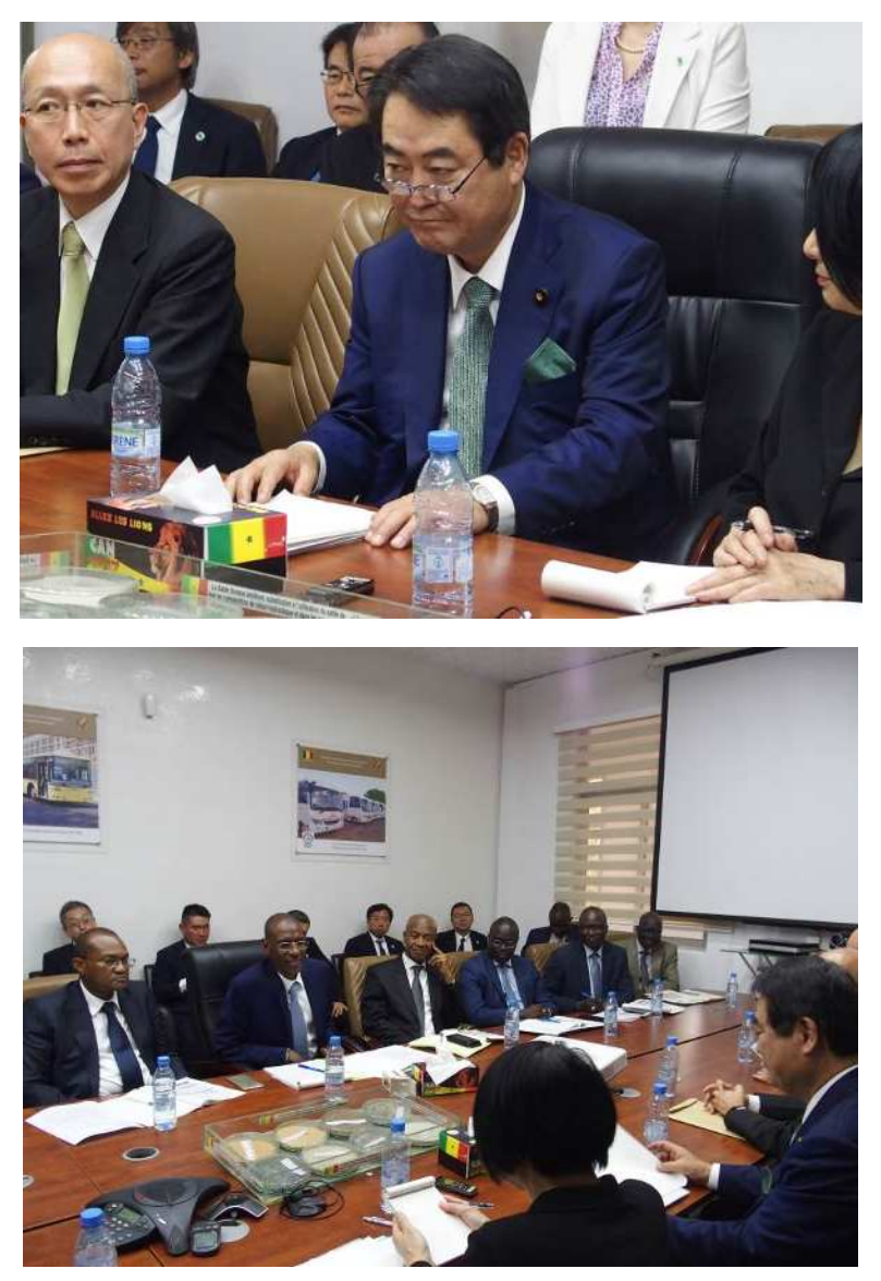
<Meeting with Minister of Infrastructures, Land Transport and Opening-Up Diallo>

Minister of Infrastructures, Land Transport and Opening-Up Diallo welcomed the delegation from Japan and explained the current situation and potential of Senegal. He stated that he would like to create local employment by taking advantage of cooperation with Japan in the infrastructure sector. Based on the signed memorandum, we confirmed to hold "Quality Infrastructure Dialogue" by this fall as a follow-up to the conference.