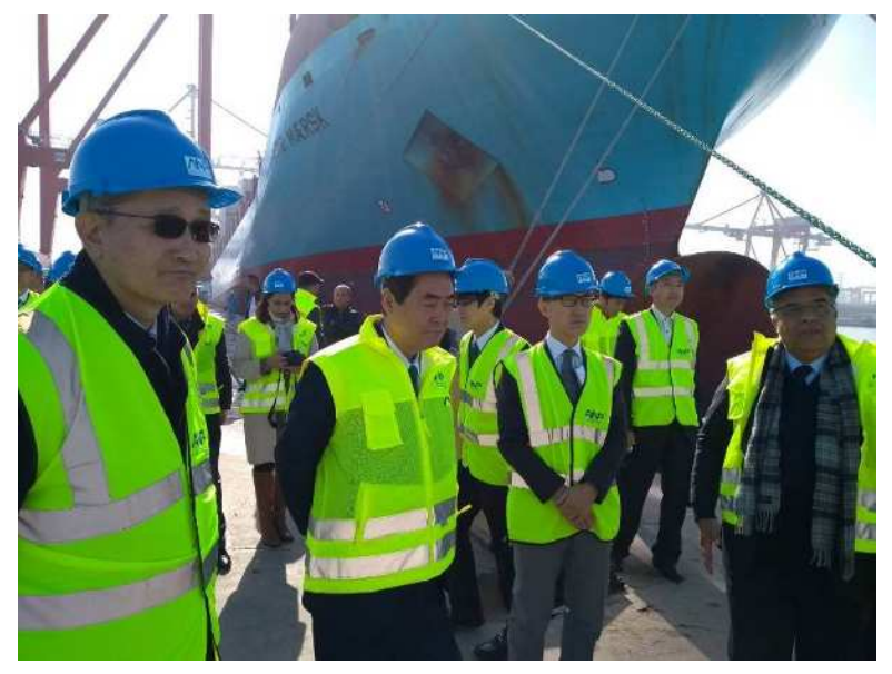
<Visit to Port of Casablanca>

State Minister of Land, Infrastructure, Transport and Tourism Makino visited infrastructure development sites including the Port of Casablanca in Morocco.