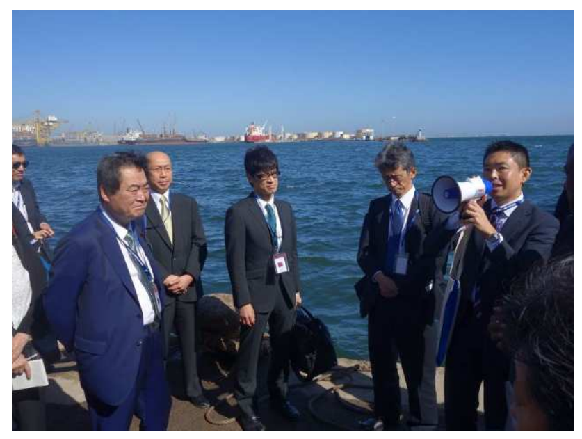
<Visit to Port of Dakar>