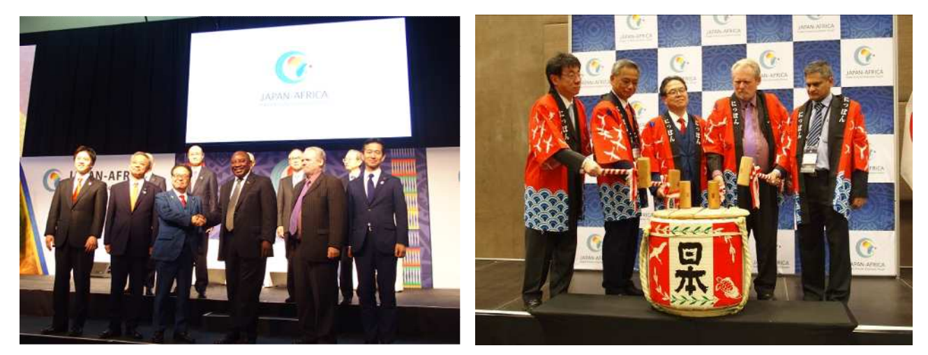
Plenary Session (Keynote Speech)

President of South Africa Ramaphosa, 42 African countries including 28 Ministers, approximately 500 African companies and others