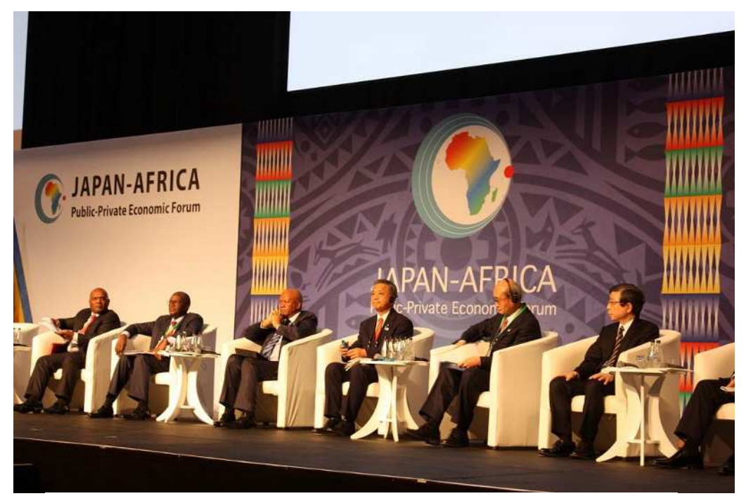
Plenary Session II "Energy and Infrastructure Enhancement in Africa"

Promoting infrastructure development in Africa while valuing partnerships with local people is the most important element in improving the quality of infrastructure, and this is the core concept of Japanese-style "Quality Infrastructure." The Government of Japan, including the Ministry of Land, Infrastructure, Transport and Tourism, will further promote strategic efforts in cooperation with the public and private sectors toward TICAD7, which is scheduled to be held in Yokohama next year."