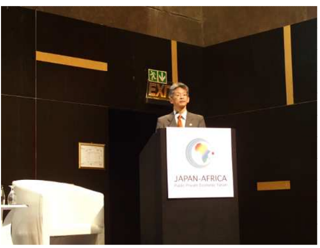
Keynote Speech (Deputy Minister for Construction, Engineering and Real Estate Industry Aoki)

In the keynote speech, Deputy Minister for Construction, Engineering and Real Estate Industry Aoki made a presentation on "Cooperation for High Quality Infrastructure Development in Africa and Japan."