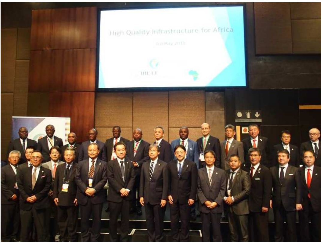
Side Event "High Quality Infrastructure for Africa" Conference