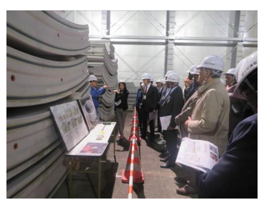
<Explanation at the Construction Site>