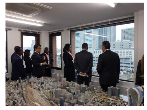
<Development Site Overlooked from the Building>