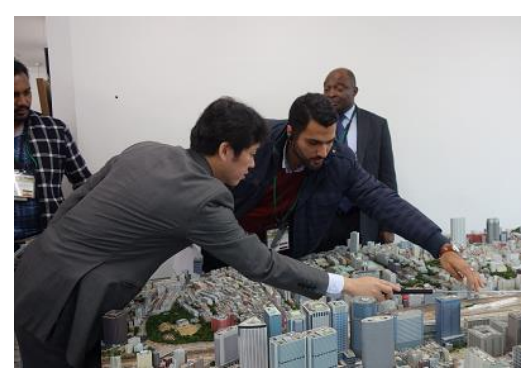
<Explanation of the Project with Models>

At the office near the development site, JR East explained with the models about the development plan of the north area of Shinagawa station including new station of Yamanote Line (Takanawa Gateway station) and overlooked the site. Participants showed the interests in the background of development plan, residential plan with international standards and the development effects of new station.