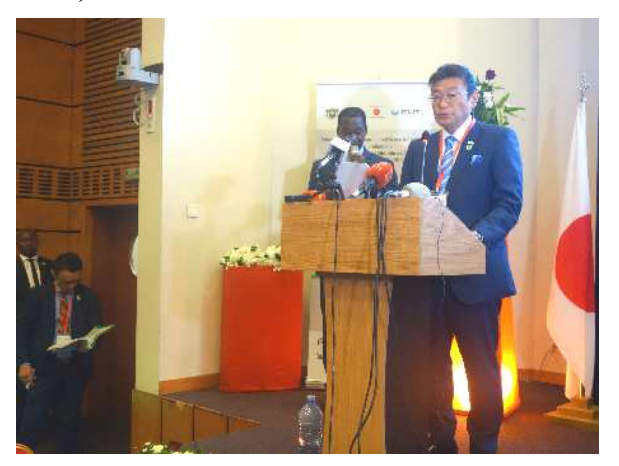
State Minister Otsuka's Remarks in the Seminar

Minister of Commerce and Industry Diarrassouba made opening remarks on his expectations for infrastructure investment taking the opportunity of TICAD7. State Minister Otsuka stated that we would like to contribute to the development of Cote d'Ivoire with the concept of "Quality