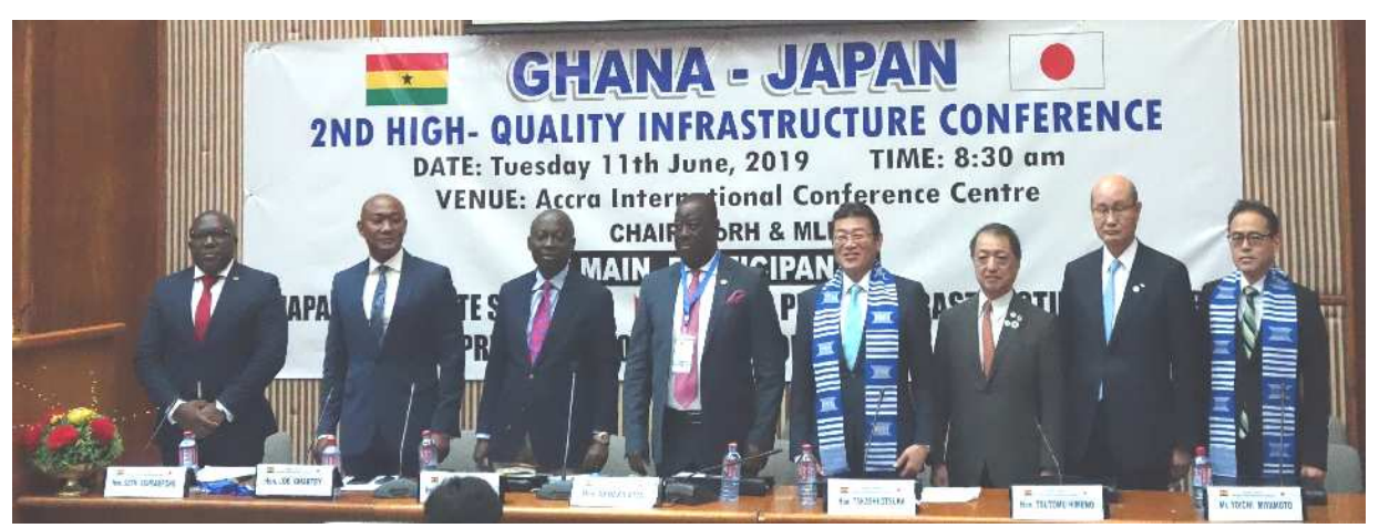
(Note) TICAD: Tokyo International Conference on African Development is an international conference held with the theme of African development. TICAD VI was held in Nairobi, Kenya in August 2016 and TICAD7 will be held in Yokohama, Japan in August 2019. MLIT is going to host the Africa-Japan Public-Private Conference for High Quality Infrastructure.